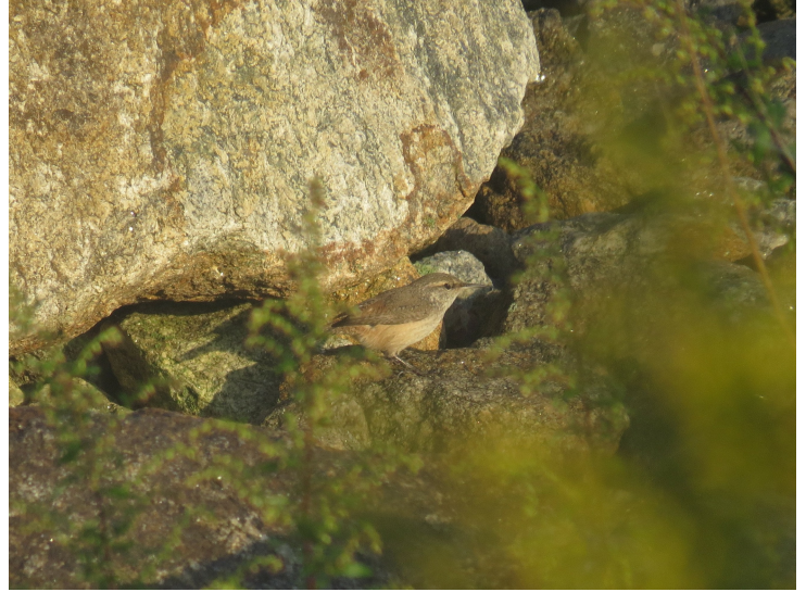
Rock Wren, Montgomery, PA 3.JPG