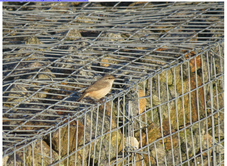
Rock Wren, Montgomery, PA.JPG