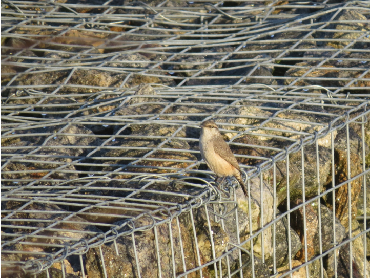
Rock Wren, Montgomery, PA 2.JPG