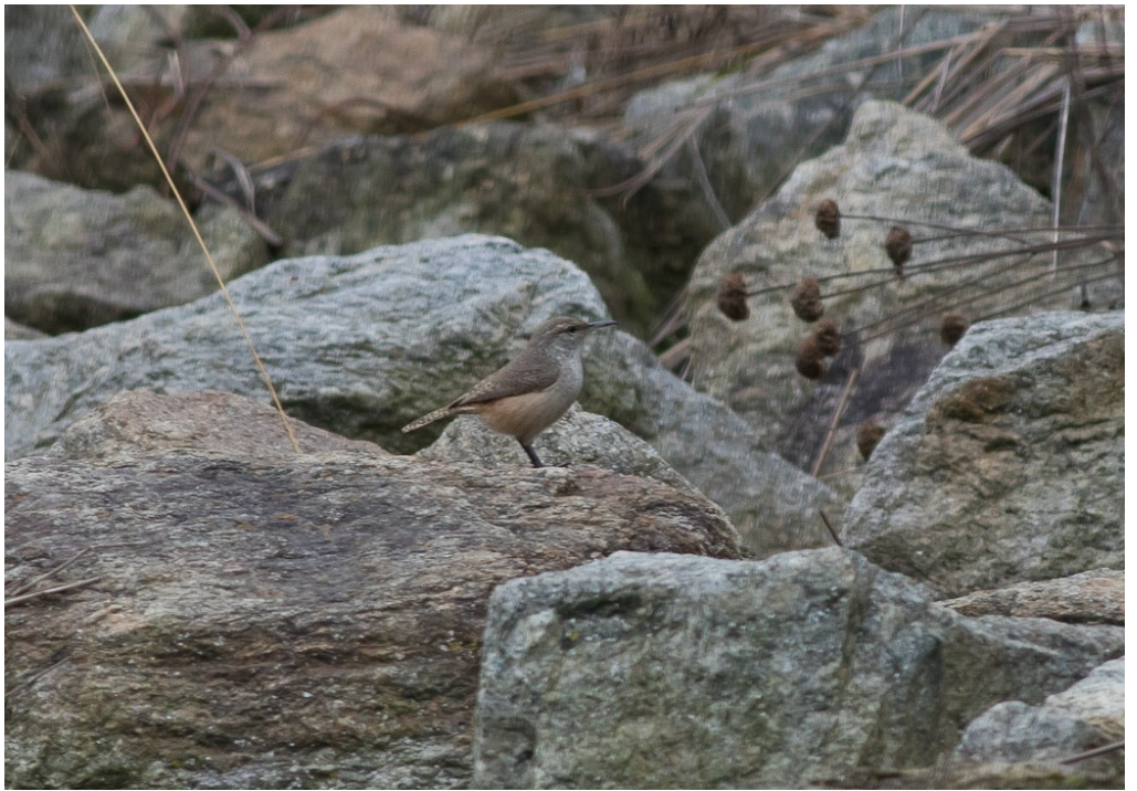
Rock Wren, Dixon Meadow Preserve, Montgomery County, PA 10-6-2018 (3)A.jpg