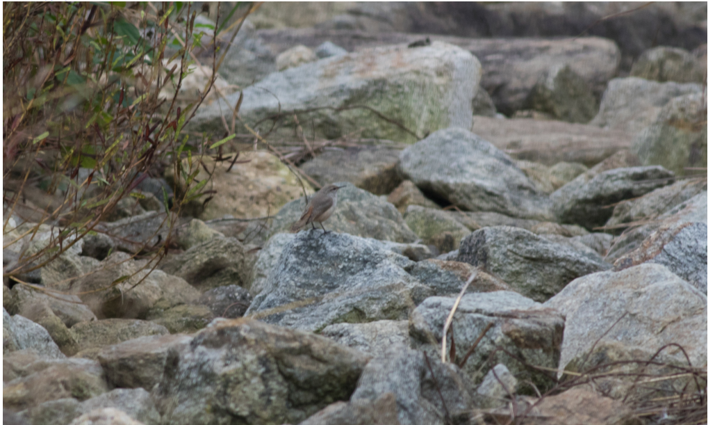
Rock Wren, Dixon Meadow Preserve, Montgomery County, PA 10-6-2018 (4).jpg